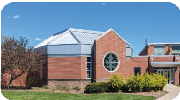
North Campus - High School and Middle School