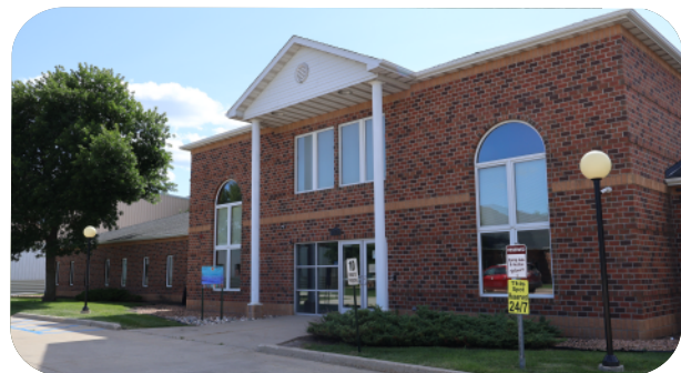
South Campus - Elementary School and Kjos Early Learning Center