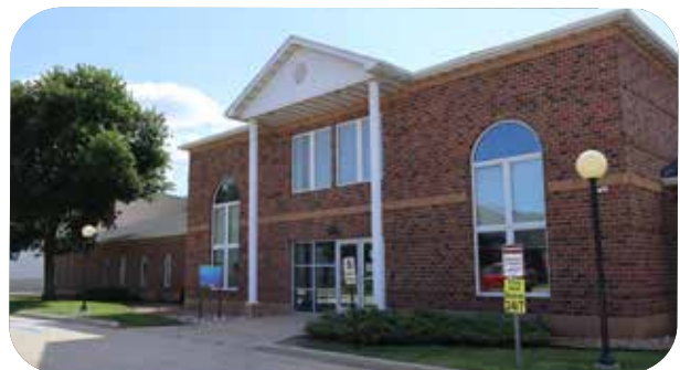
North Campus - High School and Middle School